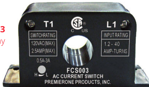
FCS003 Current Sensing Relay

For product training, please visit DynamicAQSTraining.com and login or sign-up to start learning!