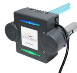
FM2-16/5 120/240 volt 16" lamp 180 microwatts UVC unit with 5" oxidation lamp

Intensity will increase as you get closer to the lamp. Refer to the lamp intensity factor chart.