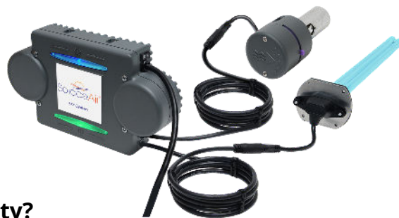
RM2-16/5 120/240 volt 16" lamp 180 microwatts dual remote UVC/UWV unit with remote 5" oxidation lamp

Yes! Our 24V Economy Remote is not designed for the return airborne inactivation, but it is great for this coil application and our 180 microwatt remotes are exceptional for this application as well.